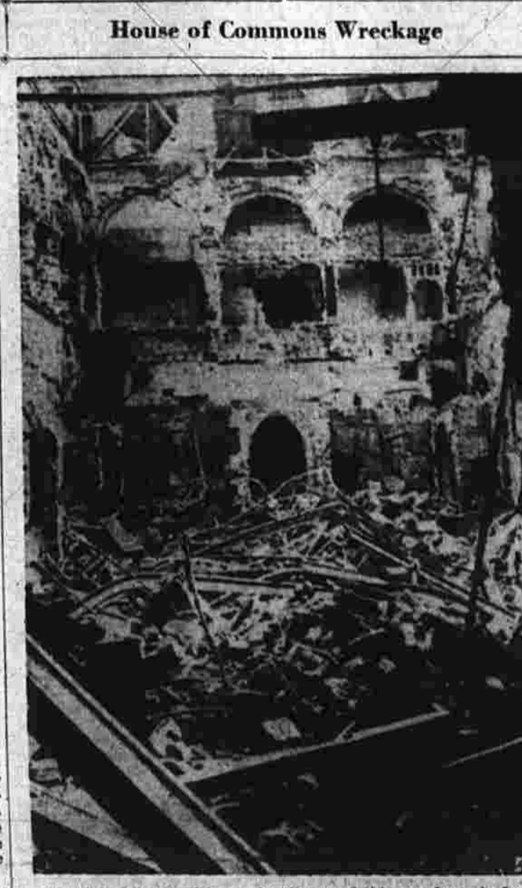
House of Commons Wreckage

A direct hit by a German bomb caused this wreckage in London's House of Commons during the heavy raid over the British capital May 10. Buildings of Westminster Abbey and other famous landmarks were also struck and damaged in the raid. (Picture by cable from London to New York.)